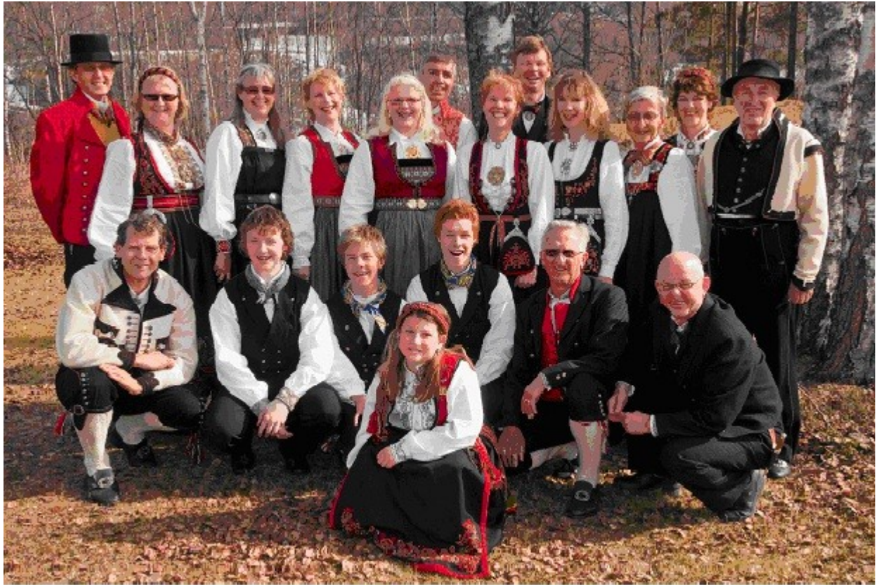
Leikarring BUL Kongsberg